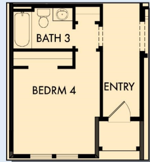
OPTIONAL BEDROOM 4 WITH BATH 3 AT STUDY