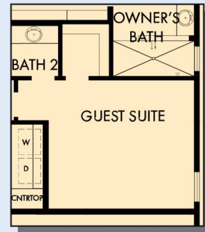
OPTIONAL GUEST SUITE AT BEDROOM 2 AND 3