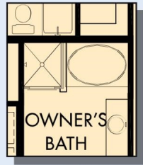
OPTIONAL TUB AND SHOWER AT OWNER'S BATH