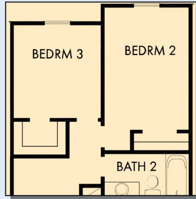
OPTIONAL BEDROOM 3 AT RETREAT