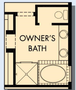
OPTIONAL DROP IN TUB WITH SEPARATE SHOWER AT OWNER'S BATH