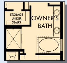
OPTIONAL DROP-IN TUB AND SEPARATE SHOWER AT OWNER'S BATH