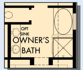
OPTIONAL SLIP IN TUB WITH SEPARATE SHOWER AT OWNER'S BATH