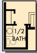
OPTIONAL HALF BATH AT BONUS CLOSET