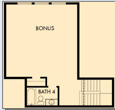
OPTIONAL SECOND FLOOR BONUS WITH BATH 4

For additional options, please visit DavidWeekleyHomes.com