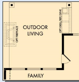
OPTIONAL OUTDOOR LIVING