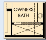
OPTIONAL SUPER SHOWER AT OWNERS BATH