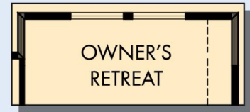
OPTIONAL EXTENDED OWNER'S RETREAT