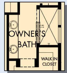
OPTIONAL WALK-IN SHOWER AT OWNER'S BATH