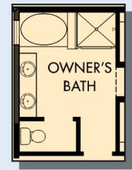
OPTIONAL SLIP-IN TUB WITH SEPARATE SHOWER AT OWNER'S BATH