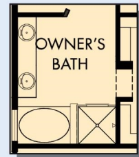
OPTIONAL SLIP-IN TUB WITH SEPARATE SHOWER AT OWNER'S BATH