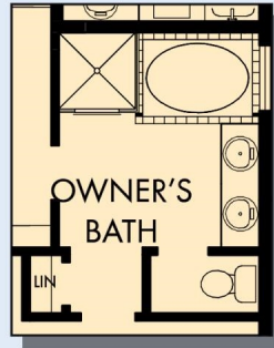
OPTIONAL DROP IN TUB WITH SEPARATE SHOWER AT OWNER'S BATH