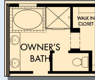
OPTIONAL DROP IN TUB WITH SEPARATE SHOWER AT OWNER'S BATH