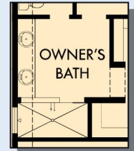
OPTIONAL WALK-IN SHOWER AT OWNER'S BATH