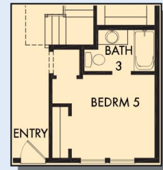
OPTIONAL BEDROOM 5 WITH BATH 3 AT DINING