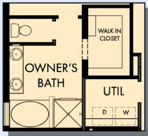
OPTIONAL OWNER'S BATH WITH SEPARATE SHOWER AND SEPARATE TUB

1,844 - 1,862 sq. ft. • 3 Bedrooms • 2 Full Baths • 2 Car Garage