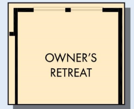
OPTIONAL EXTENDED OWNER'S RETREAT