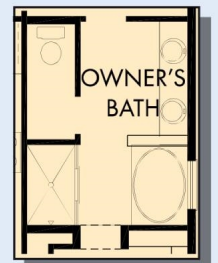
OPTIONAL SEPARATE TUB AND SHOWER AT OWNER'S BATH