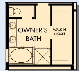
OPTIONAL DROP-IN TUB AND SHOWER AT OWNER'S BATH