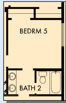
OPTIONAL BEDROOM 5 AT RETREAT