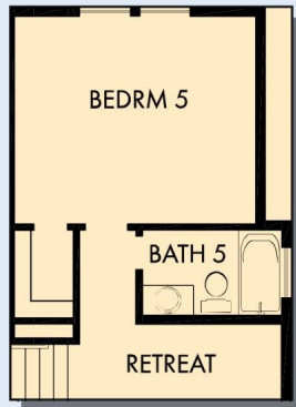
OPTIONAL BEDROOM 5 WITH BATH 5 AT RETREAT