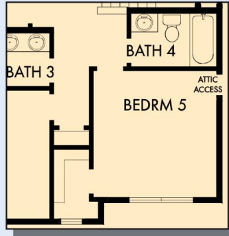
OPTIONAL BEDROOM 5 WITH BATH 4