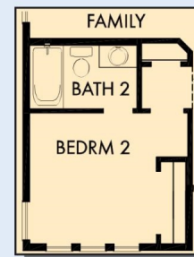
OPTIONAL BEDROOM 2 AT STUDY