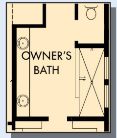
OPTIONAL SUPER SHOWER AT OWNER'S BATH