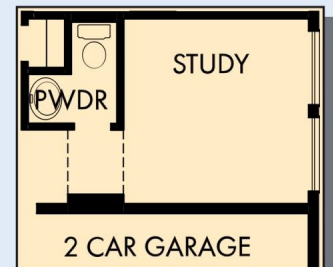
OPTIONAL POWDER BATH AT STUDY