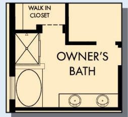
OPTIONAL TUB AND SHOWER AT OWNER'S BATH