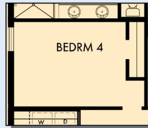
OPTIONAL BEDROOM 4 AT STUDY