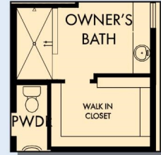
OPTIONAL SUPER SHOWER AT OWNER'S BATH