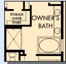
OPTIONAL DROP-IN TUB AND SEPARATE SHOWER AT OWNER'S BATH