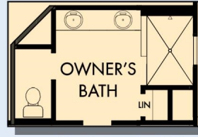
OPTIONAL SUPER SHOWER AT OWNER'S BATH