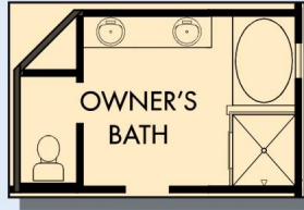
OPTIONAL SLIDE-IN TUB WITH SEPARATE SHOWER AT OWNER'S BATH