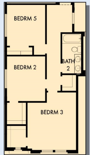
OPTIONAL BEDROOM 5 AT RETREAT