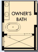
OPTIONAL SUPER SHOWER WITH FREE STANDING TUB AT OWNER'S BATH

3,226 - 3,231 sq. ft. • 4 - 5 Bedrooms • 3 - 4 Full Baths • 1 Half Bath • 3 Car Garage