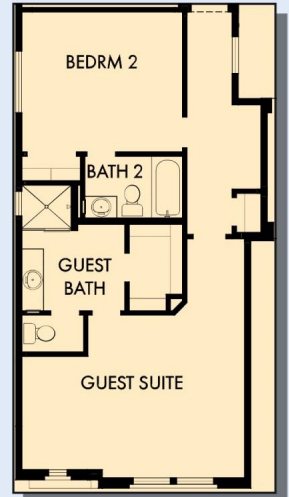
OPTIONAL GUEST SUITE