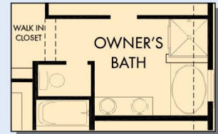
OPTIONAL SLIP IN TUB WITH SEPARATE SHOWER AT OWNER'S BATH