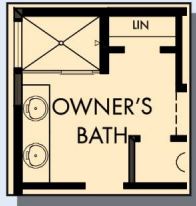
OPTIONAL EXTENDED SHOWER AT OWNER'S BATH