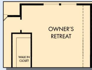
OWNER'S RETREAT WALK IN CLOSET OPTIONAL EXTENDED OWNER'S RETREAT