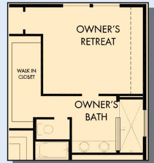
OWNER'S RETREAT WALK IN CLOSET OWNER'S BATH OPTIONAL WALK-IN SHOWER AT OWNER'S BATH