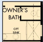
OWNER'S BATH OPT SINK OPTIONAL SHOWER AT OWNER'S BATH