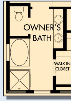
OPTIONAL SLIP IN TUB WITH SEPARATE SHOWER AT OWNER'S BATH