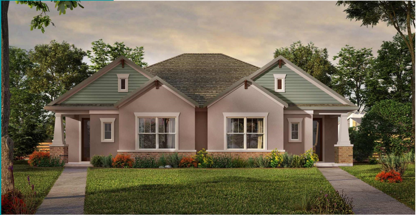
7696 TAM - A