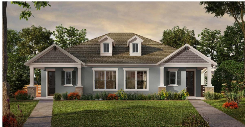
7696 TAM - B