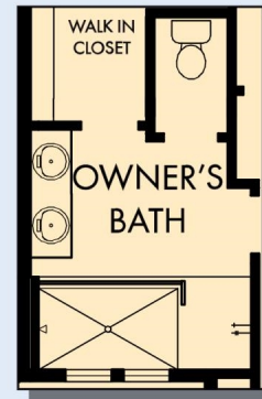
OPTIONAL SHOWER WITH FULL GLASS AT OWNER'S BATH