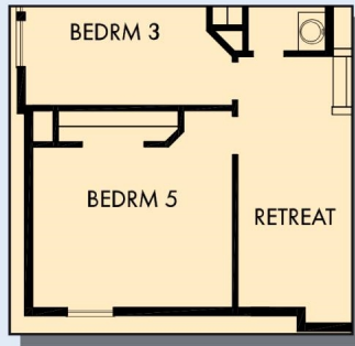
OPTIONAL BEDROOM 5 AT RETREAT