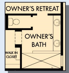
OPTIONAL SUPER SHOWER AT OWNER'S BATH