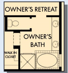
OPTIONAL DROP-IN TUB WITH SEPARATE SHOWER AT OWNER'S BATH