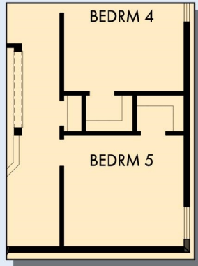
OPTIONAL BEDROOM 5 AT RETREAT