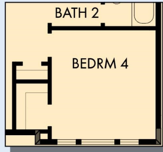
OPTIONAL BEDROOM 4 AT RETREAT