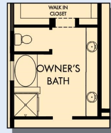
OPTIONAL SLIP-IN TUB WITH SEPARATE SHOWER AT OWNER'S BATH