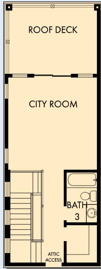
OPTIONAL THIRD FLOOR CITY ROOM WITH ROOF DECK

For additional options, please visit DavidWeekleyHomes.com