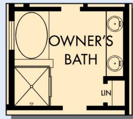
OPTIONAL SLIP-IN TUB WITH SEPARATE SHOWER AT OWNER'S BATH