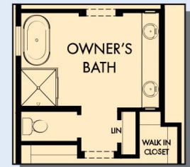
OPTIONAL FREE STANDING TUB AND SEPARATE SHOWER AT OWNER'S BATH