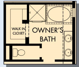
OPTIONAL TUB AND SHOWER AT OWNER'S BATH