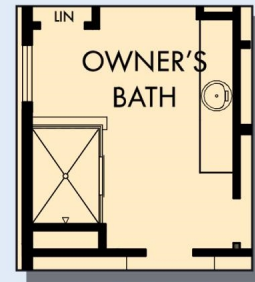
OPTIONAL SHOWER AT OWNER'S BATH