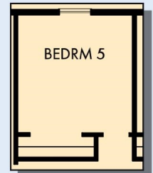
OPTIONAL BEDROOM 5 AT RETREAT