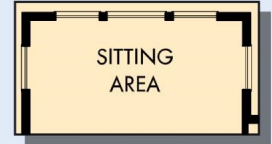
OPTIONAL SITTING AREA AT OWNER'S RETREAT