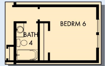
OPTIONAL BEDROOM 6 WITH BATH 4 AT STAIR HALLWAY

For additional options, please visit DavidWeekleyHomes.com