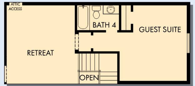
OPTIONAL GUEST SUITE WITH BATH 4