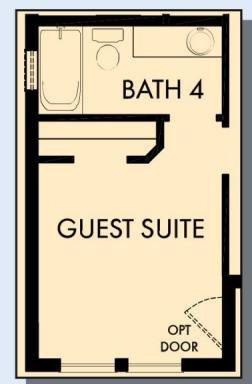
OPTIONAL GUEST SUITE AT STUDY