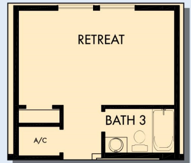
OPTIONAL BATH 3 AT RETREAT

For additional options, please visit DavidWeekleyHomes.com