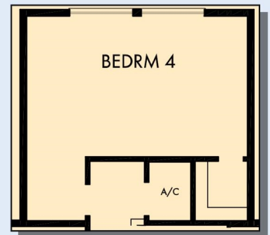
OPTIONAL BEDROOM 4 AT RETREAT