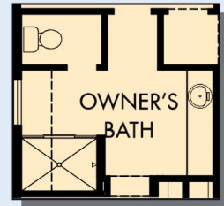
OPTIONAL SHOWER AT OWNER'S BATH