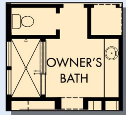
OPTIONAL WALK-IN SHOWER AT OWNER'S BATH