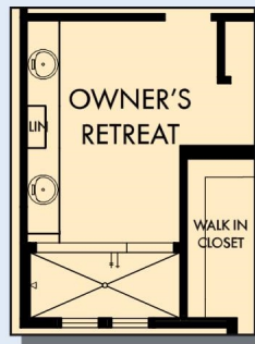
OPTIONAL SUPER SHOWER AT OWNER'S RETREAT