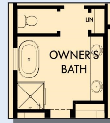
OPTIONAL FREE-STANDING TUB WITH SEPARATE SHOWER AT OWNER'S BATH