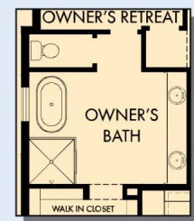
OPTIONAL FREE-STANDING TUB WITH SEPARATE SHOWER AT OWNER'S BATH