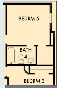
OPTIONAL BEDROOM 5 WITH BATH 3 AT RETREAT